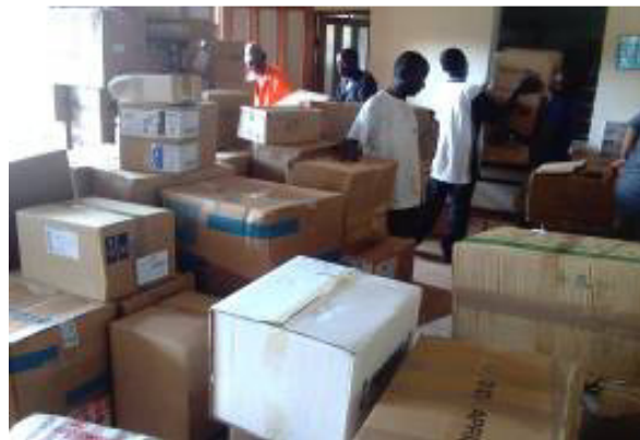
EVD Materials been received at the St. Joseph Fathers House

The Distribution of these items started on the 25 th . October 2014 at the St. Joseph Fathers Compound at exactly 8:45am, in the presence of Media coverage representatives from IRN (Independent Radio Network) and Lunsar Community Radio Station 99.1FM. A representative