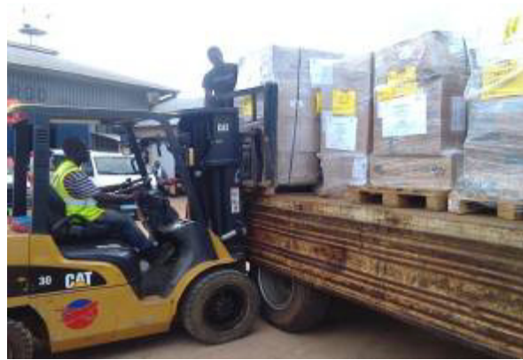
EVD Materials been loaded for Lunsar at Lungi international Airport on Sunday 19 th 2014 Airport to Lunsar