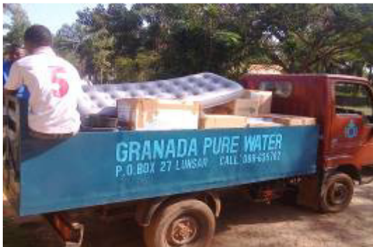
EVD Materials loaded in the St. John of God Catholic Hospital Truck before leaving for the Hospital