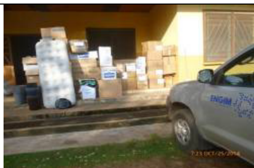
EVD Materials been displayed in front of Engim office awaiting distribution

Below are photographs of the EVD Materials been displayed in front of the St. Joseph Fathers House in Lunsar.