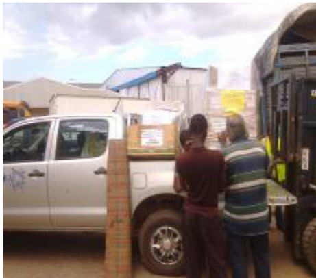
Transportation of EVD Materials from Lungi international

As an emergency response to the EVD outbreak in Sierra Leone ENGIM Internazionale and Rainbow for Africa in Italy donated the EVD Materials for distribution. The Project is titled support to Sierra Leone Health System . The packages contained Personal Protective Equipments (PPEs) and Medical Supplies which included, Inflatable Mattresses. Sprayer, Pumps, Painkillers, Antibiotics, Gloves, Boots, etc. They are 11 pallets weighing 1.6 Metric tons. These are materials meant for the Ebola Emergency for St. John of God Catholic Hospital in Lunsar, Holy Spirit Hospital in Makeni, Kissy Low Cost-Western Area, and Kabala Hospital in Kabala. These Materials were air freighted to Sierra Leone looking at the urgent need to help in combating the Ebola situation in the Country. The materials arrived at the Lungi Airport on the 19 th . Of October 2014 and were brought to the St. Joseph Fathers Compound in Lunsar on the 20 th . Of October 2014 with Salcost saline truck through the help of the St. Joseph Fathers.